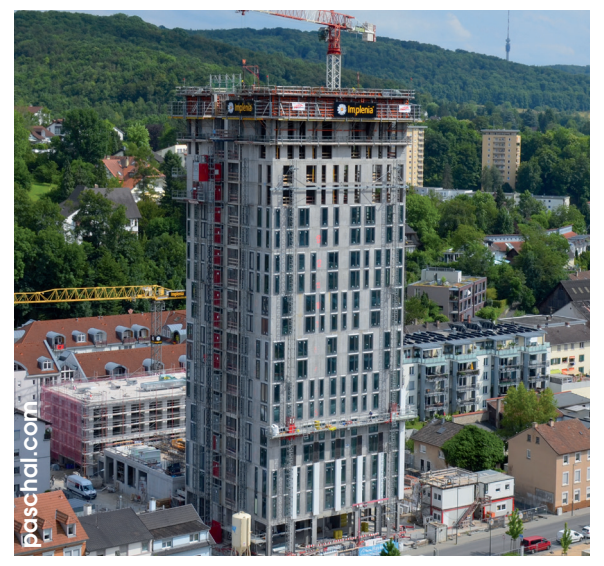
Climbing system 240 / Climbing system 200

It supports the efficiency and cost effectiveness of climbing systems in adjusting flexibly to the structure geometry and in permitting larger formwork units.