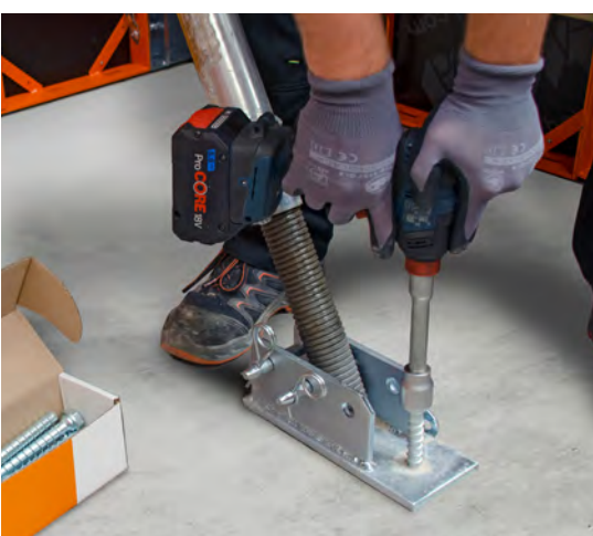
The concrete screw can be screwed into the concrete surface without any difficulty.