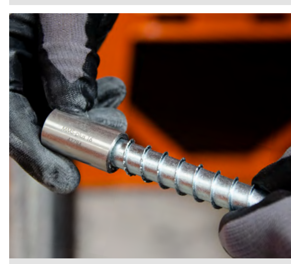
When used for temporary fixings, the included test sleeve can be used to check whether the concrete screw can be reused at any time.