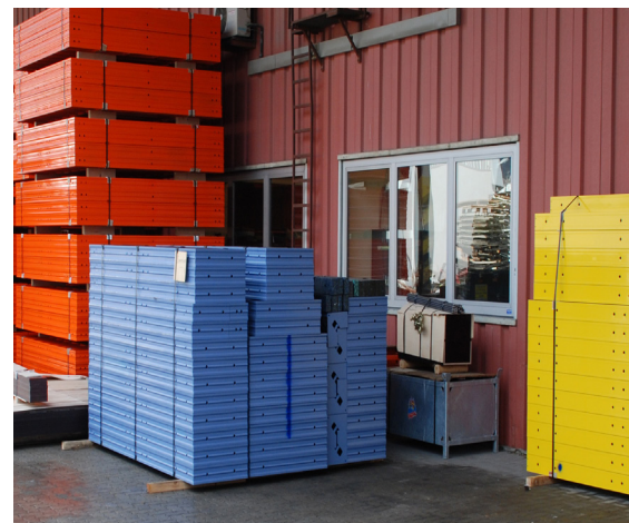
In addition to the standard manufacturer colour orange, the PASCHAL formwork panels can be coated in any RAL colour.