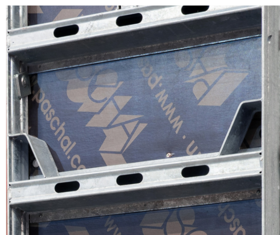
Hot-dip galvanizing ensures optimal and lasting protection against corrosion.