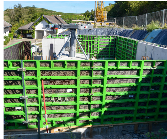
Company colours contribute significantly to the image of a company and increase recognition.

In addition to the standard powder-coated version, the formwork elements are also available with a hot-dip galvanized surface. This guarantees optimum corrosion protection and an even longer service life even in the toughest applications.