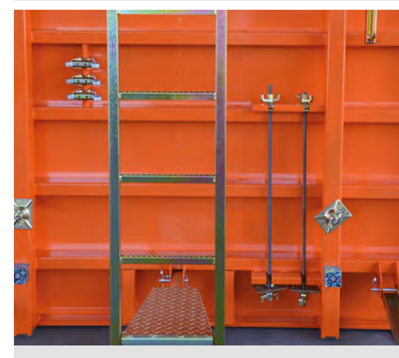
Well thought-out down to the last detail: for a tidy construction site without material loss.