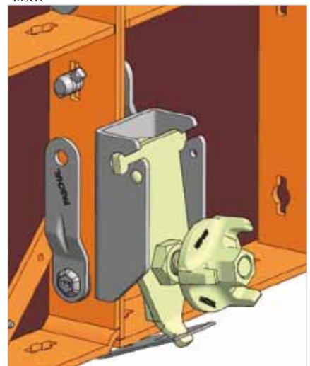
Turn – Final position

The foundation tie clamp is simple to install: to mount in the second keyhole from bottom – turn until it touches the panel frame – ready.