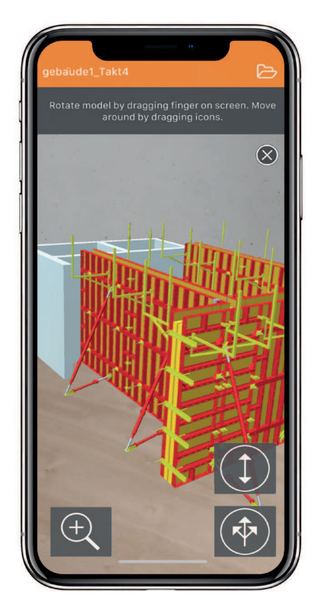
Mobile data use with the interface from PPL 12.0 to the PASCHAL AR app