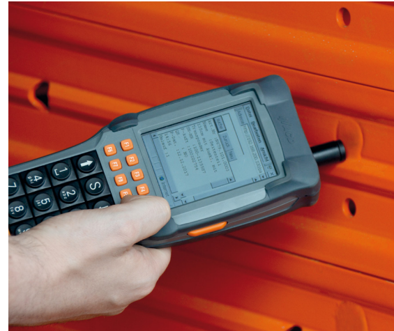
PASCHAL Ident technology gives each formwork panel an electronic number and hence provides an identity that cannot be changed, comparable with the human fingerprint.

The transponders are installed in the outer frame of the formwork panels. These can be seen in the circular depression in the outer frame.