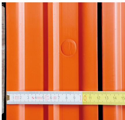
LOGO.3 and LOGO.pro wall formwork