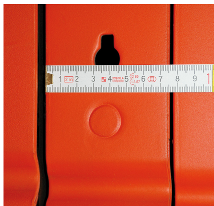
NeoR and Modular/GE universal formwork