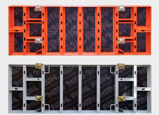
The LOGO panels are available in both steel and aluminium.