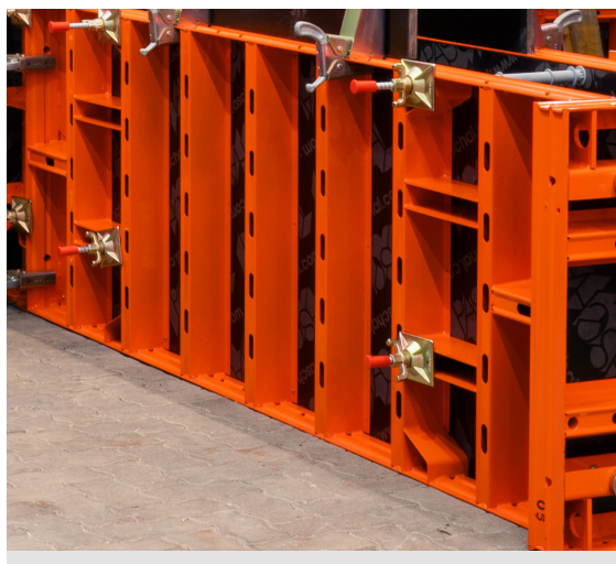
Four outside and four inside holes for ties make it useful for a wide range of applications.

All holes for ties - outside and inside - are placed symmetrically.