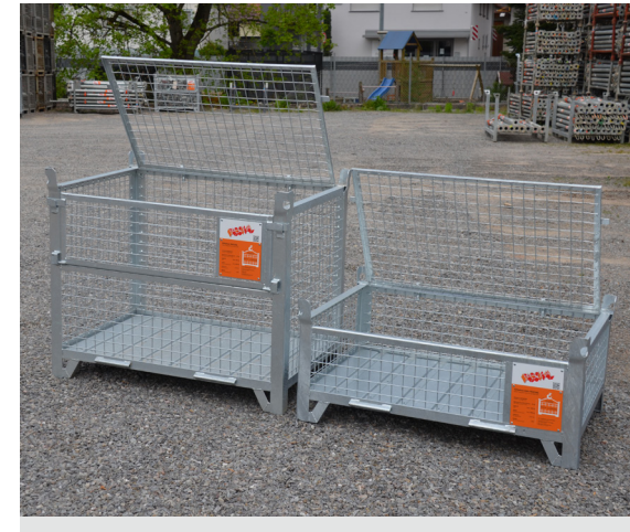
Large and small parts can be stored and transported safely and transparently with the Lattice box pallets.

The 120 x 80 cm hot-dip galvanised stacking pallets are ideal for space-saving storage and safe transport of adjustable props and stacking pallets. Thanks to the well-thought-out design and the integrated crane eyes, the pallets can be moved around easily at the construction site with a crane. In addition, the stacking pallets are perfect for transporting by forklift – thanks to the integrated forklift pockets underneath.