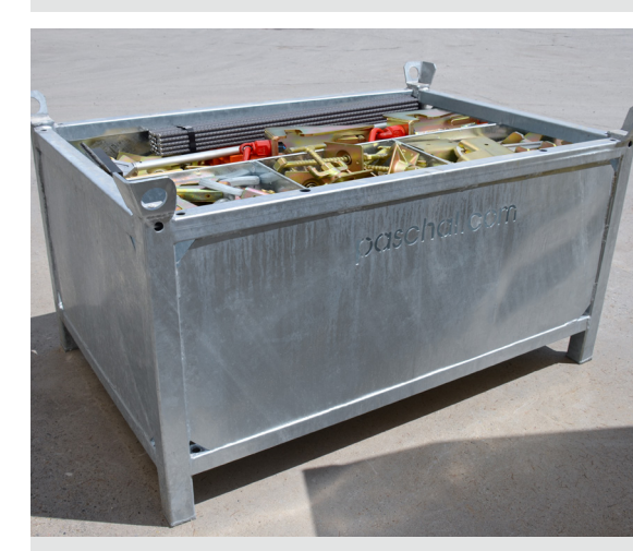
The four integrated compartments in the transportation box make the handling of numerous small and very small parts easy and more efficient. Tedious searching for parts becomes a thing of the past.