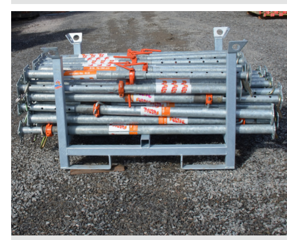
The stacking pallets are perfect for transporting adjustable props and stacking pallets. They can be easily stacked on top of each other.