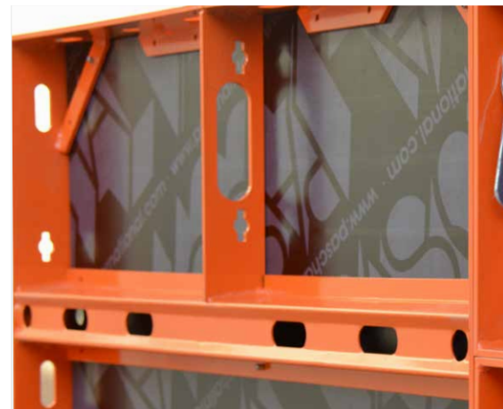
Functional bars for attaching accessories such as crane lifting clamps, fall protection, waler support, etc. and for easy transportation