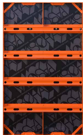
90 x 150 cm panel with internal tie-points for a wide range of applications