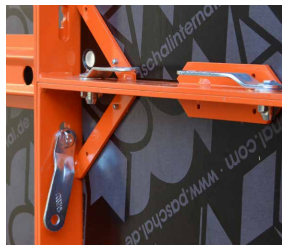
Keybolts as connecting pieces