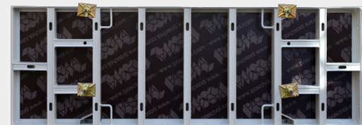
The LOGO panels are available in both steel and aluminium.