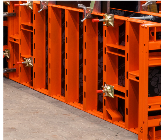
Four outside and four inside holes for ties make it useful for a wide range of applications.

All holes for ties – outside and inside – are placed symmetrically.