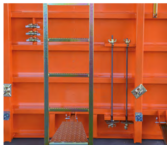
Well thought-out down to the last detail: for a tidy construction site without material loss.