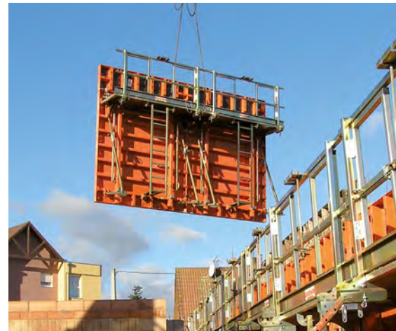
The crane lifting clamp is a core component of all formwork panels in the LOGO.S system.

The durable steel formwork skin is welded flush from the frame side so that neither screw/riev marks nor frame marks remain in the concrete and excellent exposed concrete results are achieved.