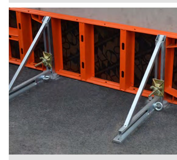
The bracket is also used for the formwork of floor panels or free slab edges.