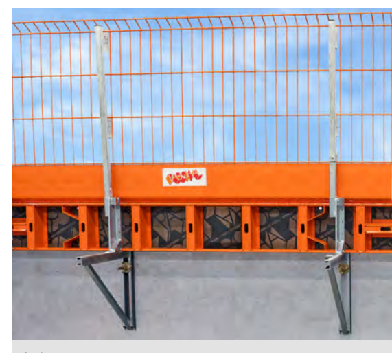
Safe working with at the slab edge combined with the Secuset lateral protection system.

Another possible application for the bracket is the formwork of floor panels or free slab edges. For this purpose, a fastening plate is first anchored with ground nails on loose subsoil or with screws, such as on slab formwork. The connection to the bracket is then likewise made on the fastening plate by means of a hook-head connection. The type of formwork is variable. Both planks and formwork panels can be used.